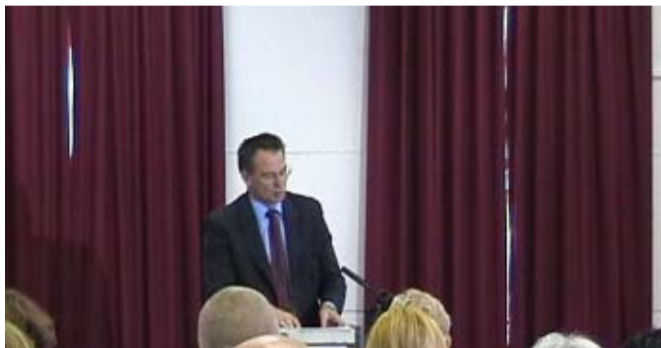
Chief Minister, Jon Stanhope speaking at Shelter's AGM

There has been some easing in the private rental market as there has been substantial unit development, however, this is mostly at the middle to upper end of the market. When demand for housing outstrips supply, rents are pushed up and landlords can pick and choose tenants. In this situation, there is a strong likelihood of increased discrimination against disadvantaged